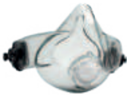
Half Mask (includes head harness)

CST1034 - Small CST1035 - Medium CST1036 - Large