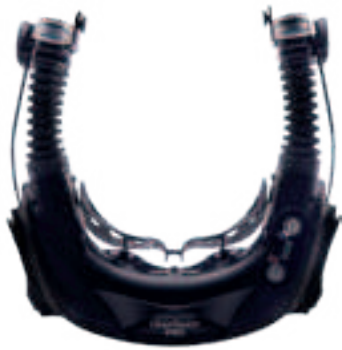
CleanSpace PRO CST1000

Power Unit, neck supports, charger & carry bag (excludes mask and filter)