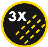
TRIPLE STITCHED SEAMS